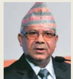
Honorable Madhav Kumar Nepal Former Prime Minister, Nepal

“ I am delighted to find that this summit has drawn a galaxy of highly accomplished leaders of private and corporate sectors. It is an eloquent testimony of new dynamism that will analyze the participation of political private sector at such summit as equal partner and catalyst agents of change and innovation in our countries. I would like to call all the leaders of the private sector representatives at the summit take a serious look as the great investment potentials of Nepal, like hydro power, water resources, organic agriculture, forest products, infrastructure development and tourism. ”