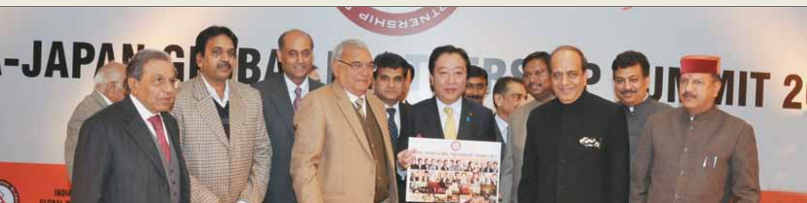
INDIA-JAPAN GLOBAL PARTNERSHIP SUMMIT 2013: NEW DELHI, INDIA - DECEMBER 27, 2011