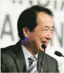
Honorable Naoto Kan Former Prime Minister, Japan

“ The relationship between India and Japan is very special, what we really do not have in India but we have in Japan so I think India and Japan had a very complementary relationship. We would like to put best efforts so that we can produce best results by the cooperation between India and Japan. ”