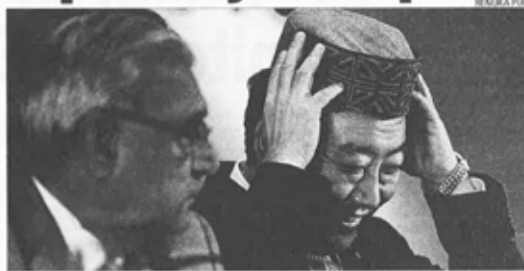
Japan PM Yoshihiko Noda with Haryana CM Bhupinder Singh Hooda on Tuesday.