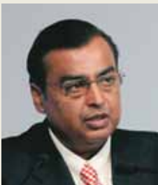
Mukesh D. Ambani Mentor, India Japan Global Partnership Summit (IJGPS) Chairman and Managing Director, Reliance Industries Limited, India

“ This summit could not have happened at the more opportune time. Countries across the world are reeling under sovereign economic burden. Newer grounds have to be broken to address these challenges. Next generation partnerships that go beyond the walks of new paradigm, needs to be structured. I am delighted that this Summit is a part of such partnerships that hold tremendous promise for the future of our world. Japan-India has great potential but we have begun slowly. This is a great opportunity for our best minds to have a dialogue together. Let the power of great ideas shape the thinking over the next few days and let the spirit of big dreams, engulf us in the process, so that we not only shape a road map for a great Japan-India relationship, that the world can not only follow in the coming century but also build a peaceful, prosperous and a harmonious world. ”