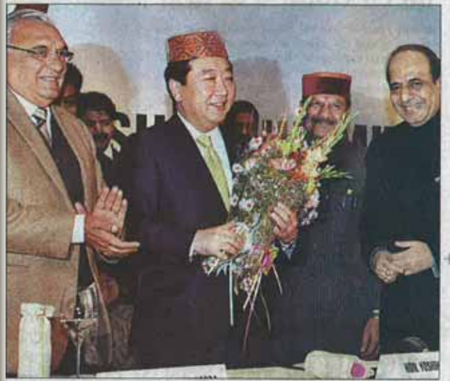
नई दिल्ली में मंगलवार को भारत-जपान वैश्विक भागीदारी सम्मेलन में जपान के प्रधानमंत्री योशिहिको नोदा के स्वागत में मुख्यमंत्री भूपिंडर सिंह हुड्डा और रेल मंत्री दिनेश त्रिवेदी।