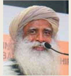
Sadhguru Jaggi Vasudev Founder, Isha Foundation, India

“ The relationship between India and Japan goes way beyond trade, economics or commerce. India is right now an explosion of economic activity. The process of the journey from poverty to prosperity is one, which demands various sacrifices from people, if not handled properly can become very painful. Japan has already made this journey, India is in the process so in this aspect, Japan could offer a paternal hand, which will be very valued in India. ”