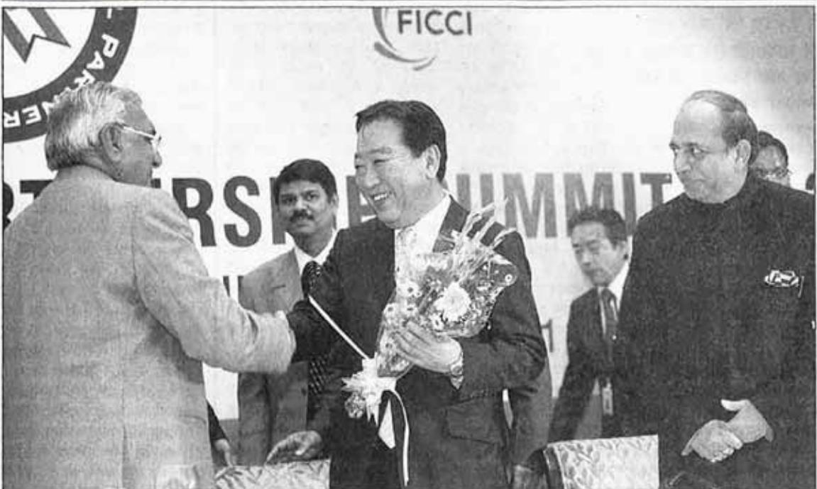
नई दिल्ली में मंगलवार को भारत-जापान वैश्विक साझेदारी सम्मेलन के दौरान जापान के प्रधानमंत्री योशिको नोडा से हाथ मिलाते हरियाणा के मुख्यमंत्री भूपिंदर सिंह हुड्डा।