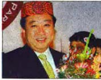
भारत-जापान वैश्विक भागीदारी सम्मेलन में हिस्सा लेने जापान के प्रधानमंत्री योशिको नोडा मंगलवार को नई दिल्ली पहुंचे।

उद्योग जगत के लोग इस बात को लेकर आश्वस्त हैं कि जापान भारत सरकार के आग्रह को जरूर स्वीकार करेगा। जापान ने इस तरह का करेंसी स्वैप समझौता हाल ही में चीन के साथ वहां की मुद्रा युआन के लिए किया है। जानकारों का कहना है कि जापान भारत का एक प्रमुख कारोबारी साझेदार है और भारतीय रुपये व जापानी येन के बीच भुगतान संबंधी समझौता होने से