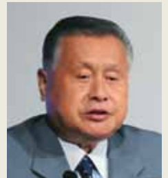
Honorable Yoshiro Mori Honorary Chairman, India-Japan Global Partnership Summit (IJGPS) and Former Prime Minister, Japan

“ Since I visited India 10 years ago and all of you are here today. . . . I take this opportunity to thank you all and I also express my appreciation for your visit to Japan. I am so glad to see that this India Japan Global Partnership Summit is held here with the participation of such large audience. This summit has many different stake holders participating, I hope with this kind of stake holder participation in this summit we can go a step further with ultimate goal and together we can. ”