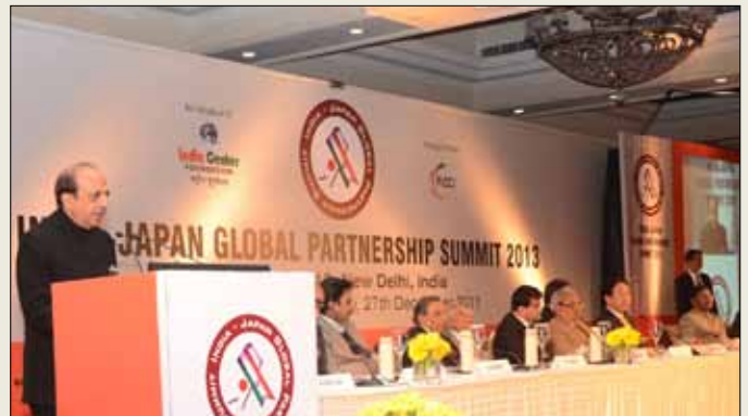
Shri Dinesh Trivedi addressing the gathering at the IJGPS 2013 Announcement Ceremony.