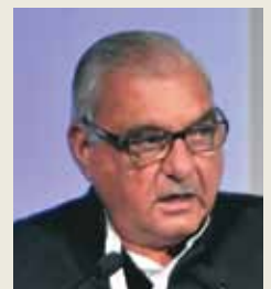
Bhupinder Singh Hooda Chief Minister Haryana, India

“ We wish to see Japan as unique model of growth for the world economy and a center of technological excellence. I strongly believe that we can and must synergize our mutual strength to impart a momentum to Asian as well as global economic growth and prosperity. Although we had a macro partnership, now this is time to go micro people to people partnership, small and medium industries are need of the hour as well as Japan has technology and we have human resources so it is win-win for both the countries. I sense a new enthusiasm and vibrancy that gives me the reason to believe that's my long cherished vision will be realized. ”