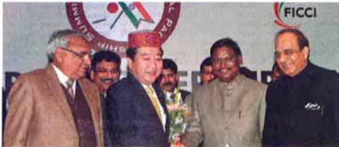
Mr Yoshihiko Noda, Prime Minister of Japan, with Mr Bhupinder Singh Hooda, Chief Minister of Haryana; Mr Arjun Munda, Chief Minister of Jharkhand; and Mr Dinesh Trivedi, Railway Minister, in the Capital on Tuesday.

Our Bureau New Delhi, Dec. 27 The India-Japan Global Partnership Summit (IJGPS) 2013 was launched here on Tuesday by Mr Yoshihiko Noda, Prime Minister of Japan. The joint initiative of India Centre Foundation and Federation of Indian Chambers of Commerce and Industries (FICCI) aims to forge stronger ties between the two nations.