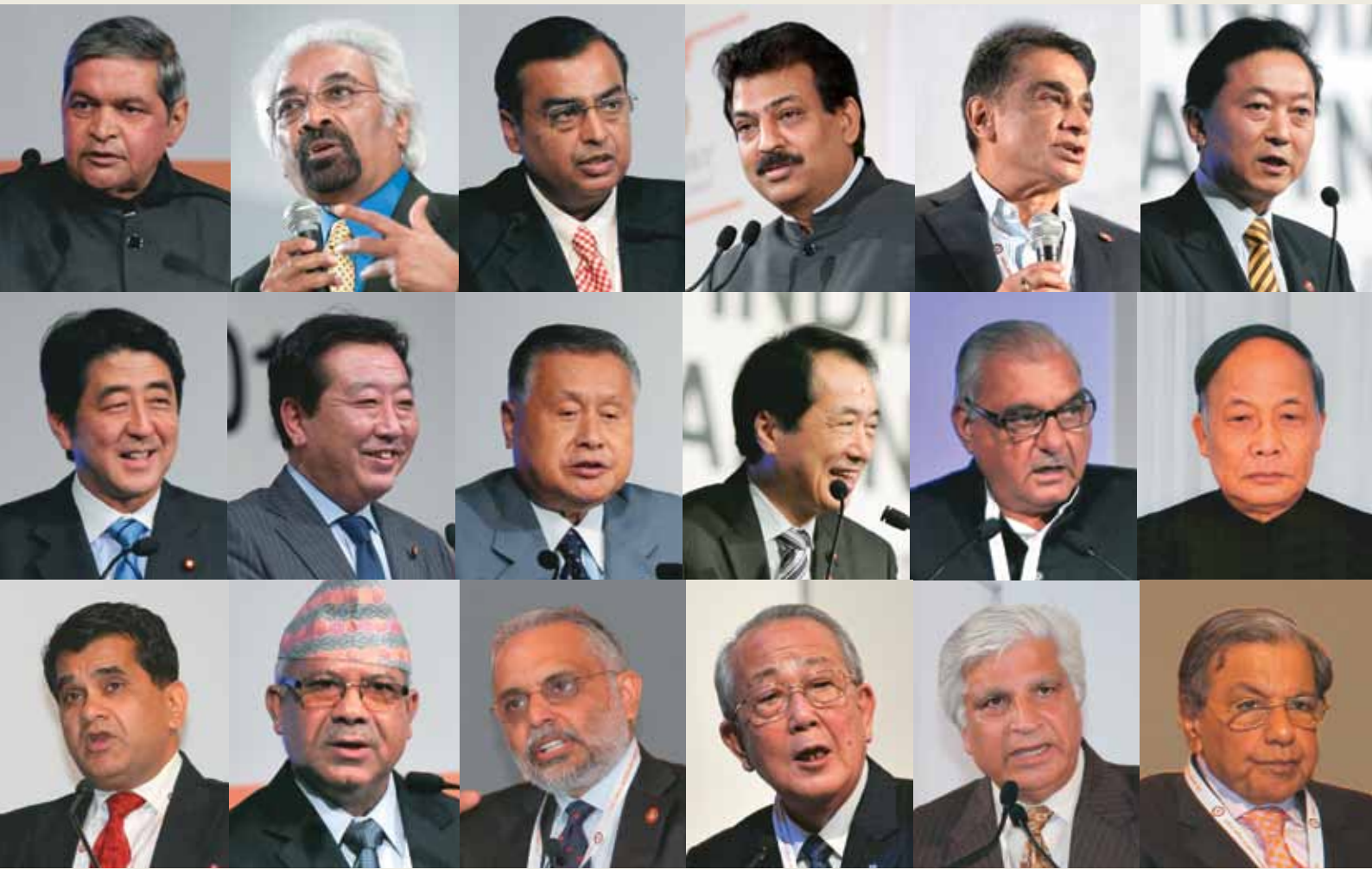
INDIA-JAPAN GLOBAL PARTNERSHIP SUMMIT 2011: TOKYO, JAPAN - SEPTEMBER 5 ~ 7, 2011