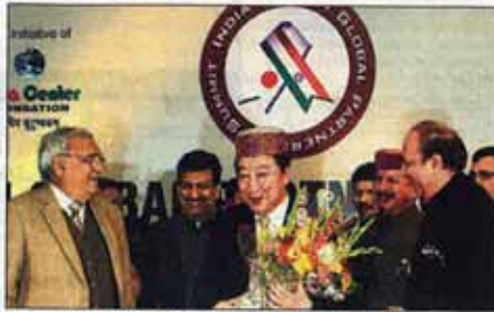
Japan PM Yoshihiko Noda with Haryana CM Bhopinder Singh Hooda (L) and railway minister Dinesh Trivedi in New Delhi.

The agreement would effectively mean that Japan will accept rupees and give dollars to India up to a stipulated limit, and similarly India will take yen and send dollars to Japan if speculators seek to thrash down