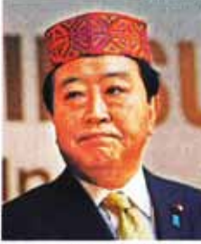
Increasing cooperation: Japanese Prime Minister Yoshihiko Noda.

Noda, who arrived in the country on Tuesday on a three-day visit, is scheduled to meet Prime Minister Manmohan Singh on Wednesday. "We will have discussions