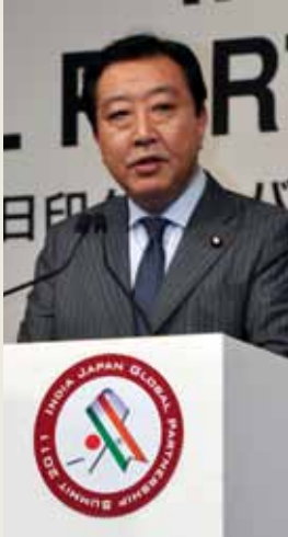
His Excellency Yoshihiko Noda Prime Minister, Japan

“ One of my favorite phrases goes like this- ‘anything that last for 10 years is great, anything that last for 20 years is tremendous and anything lasts for 30 years becomes history’. And the India Japan Global partnership Summit has entered into the forum of greatness. I expect from the bottom of my heart, that it will last at least 30 years after which it will become a historic existence. I expect that the 10th anniversary of this global partnership- the summit, will further grow into a forum in which the wide range of leaders can engage deeply in exchanges and friendship. We are determined to see Japan and India as the two largest democracies in Asia and further deepen the relationships based on the strategic global partnership that both the countries had announced in 2006. I look forward to further increase in the trade and investment between the two countries and Japan would contribute to the development of India which is already showing incredible rise. Next year marks the 60th anniversary of establishment of our bilateral diplomatic relations I look forward to building upon solid and friendly relations our predecessors had forced and further strengthening bilateral ties in the coming years. ”