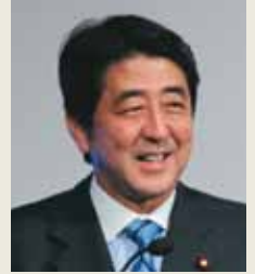
Honorable Shinzo Abe Co-Chairman, India Japan Global Partnership Summit (IJGPS) and Former Prime Minister, Japan

“ As one of the co-chairs, I would like to extend my heartfelt welcome to all the distinguished guests who have come all the way to Japan. 54 years ago my grandfather visited India as Prime Minister of Japan and 50 years after his visit, I visited India as the Prime Minister of Japan. The most promising bilateral relationship is India and Japan and then if we bilaterally can strengthen our relationship, I am sure we can also enhance our regional security and as well as our economy. India becoming stronger country will mean Japan becoming stronger as well. ”