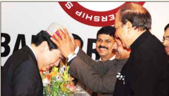
Dr. Rajeev Bindal, Minister of Health, Himachal Pradesh, presenting the traditional hat to H.E. Yoshihiko Noda, Honourable Prime Minister of Japan also in picture - Shri Dinesh Trivedi, Union Minister for Railways.